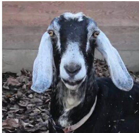
Licorice – Official Mascot 2023

"Strong encouragement to my kids has been the key to their education."