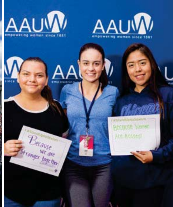
AAUW student leadership conference attendees