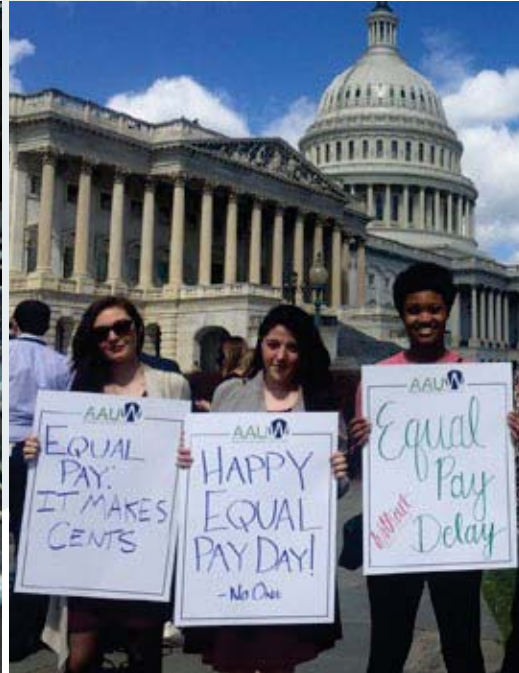
AAUW equal pay advocates on Capitol Hill