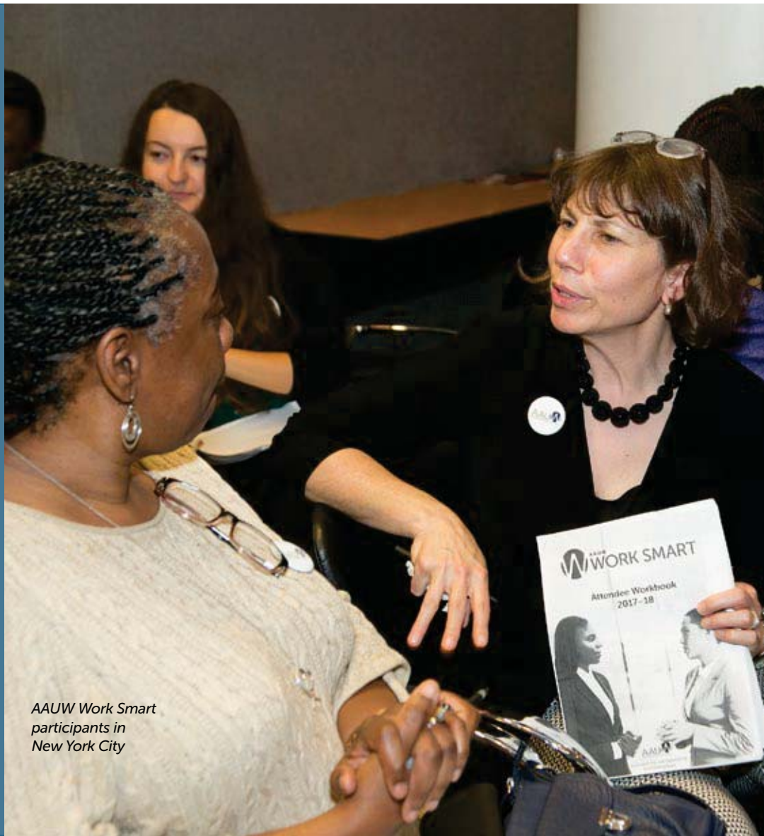
AAUW Work Smart participants in New York City