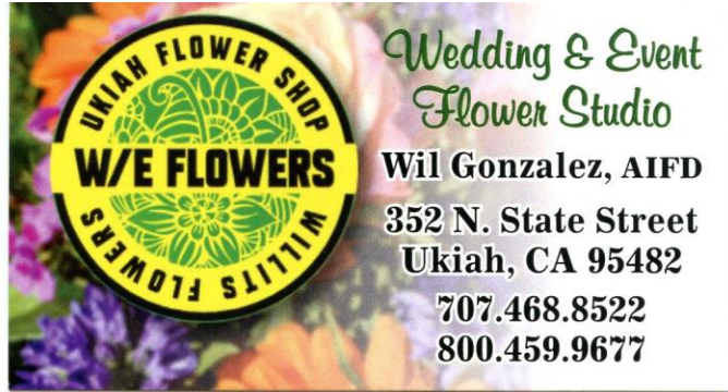
Wil Gonzalez, AIFD